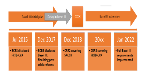
Figure 1 – Implementation timeline

Banks are now required to start reporting CVA capital charges under the new FRTB-CVA framework by January 2022. They must calculate and report CVA capital charges at the same frequency as their SA market risk, ie on a quarterly basis.