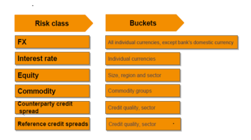
Figure 3: SA-CVA risk class buckets

The following buckets are prescribed by the supervisory authority for each risk class: